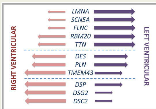
Figure 2 Genes associated with a high propensity for dilated cardiomyopathy (DCM) and ventricular arrhythmias. These arrhythmic genes included desmosomal genes that predominantly cause arrhythmogenic right ventricular cardiomyopathy (ARVC), non-desmosomal genes associated with ARVC, DCM or both, and genes that predominantly cause DCM.

Filamin C is an actin-binding cytoskeletal protein that is located at Z-discs and costameres in cardiac and skeletal muscle. It is thought to contribute significantly to the structural stability of muscle cells and to mechanical stress sensing and signal transduction. Variants in the FLNC gene can result in the formation of intracellular protein aggregates and myofibrillar myopathies and have been identified in patients with hypertrophic cardiomyopathy and restrictive cardiomyopathy [45,46]. In 2016, two groups of investigators reported that truncating variants in the FLNC gene resulted in a highly arrhythmic form of DCM that was characterised by severe early-onset ventricular dysfunction and a high prevalence of atrial arrhythmias, ventricular ectopy, ventricular tachycardia and sudden death [47,48]. Cardiac tissue from variant carriers showed reduced FLNC RNA and protein expression suggesting a loss-of-function effect. This was confirmed by studies in zebrafish embryos, with morpholino-mediated knockdown of filamin C resulting in dysmorphic or dilated cardiac chambers, pericardial oedema, and premature death [47,48]. Myocardial histological studies in the zebrafish embryos showed abnormal cardiomyocyte ultrastructure, with altered sarcomere